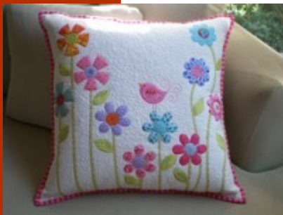
Flower Garden Pillow